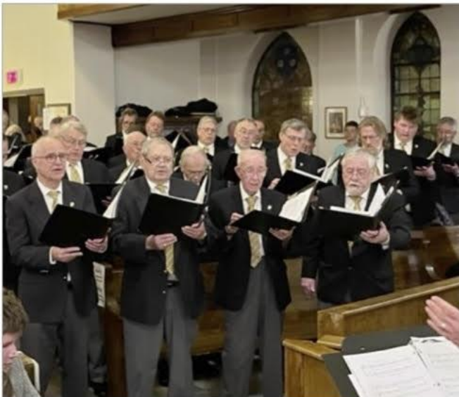
Der German Canadian Male Chorus of Calgary war einer von drei Chören, die beim "Tannenbaum Lighting Festival" gesungen haben.